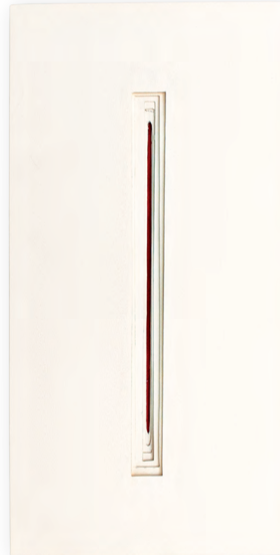
Union , 2018, gouache, 10 sheets of Fabriano paper, cut and perforated by hand with variably gauged needles, 14" x 8" x 1"

Arcs Of hope Calmly Combine Warring Hearts