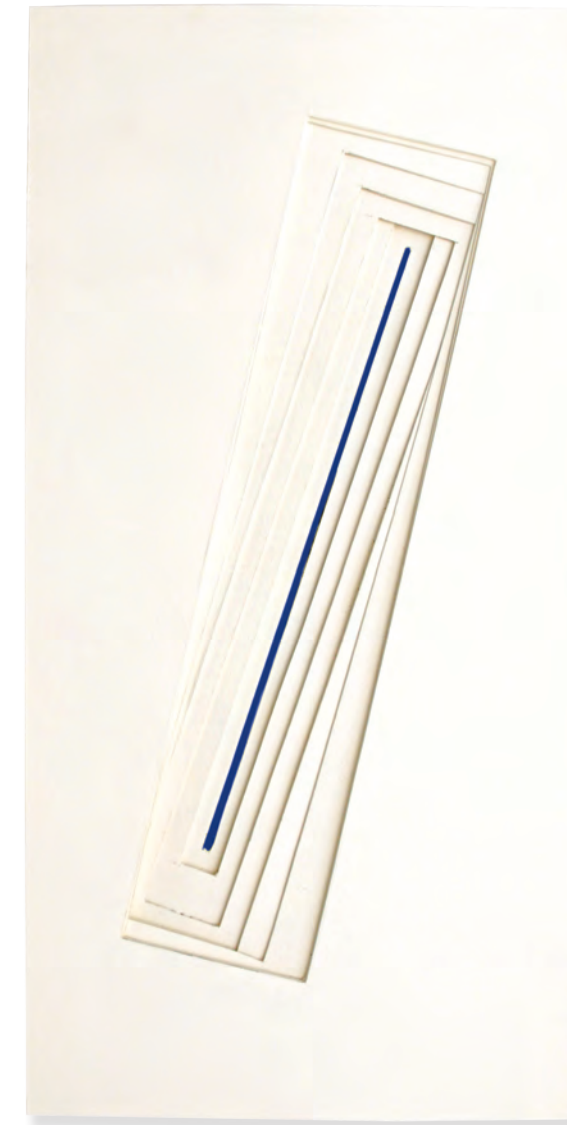
Disunity , 2018, gouache, 10 sheets of Fabriano paper, cut and perforated by hand with variably gauged needles, 12" x 6" x 1"

Culture Of deceit Harbors Weight Of failure Disunion