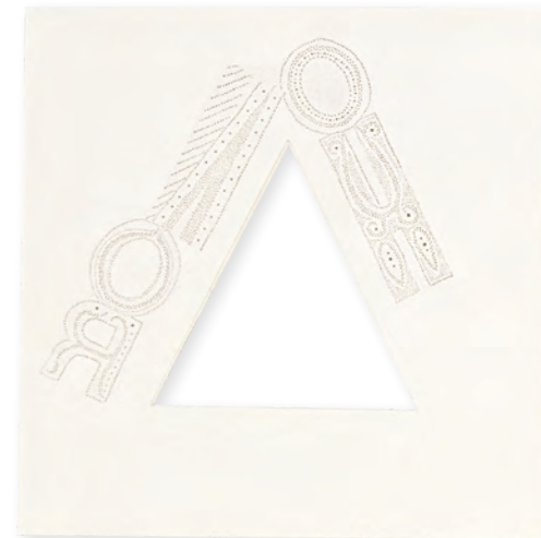
Truth , 2018, gouache, 10 sheets of Fabriano paper, cut and perforated by hand with variably gauged needles, 12" x 12" x 1"

Arcs Of hope Calmly Combine Warring Hearts